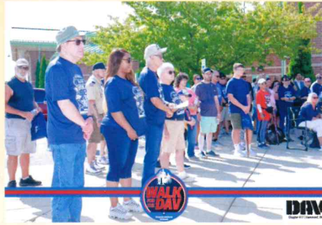
Participating in the walk.