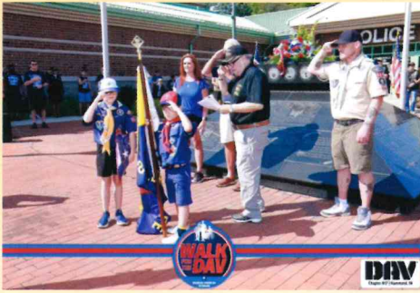
Cub Scouts and Scoutmaster leading the Pledge of Allegiance.